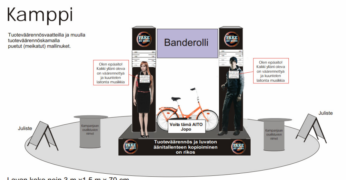
Lavan koko noin 3 m x1,5 m x 70 cm