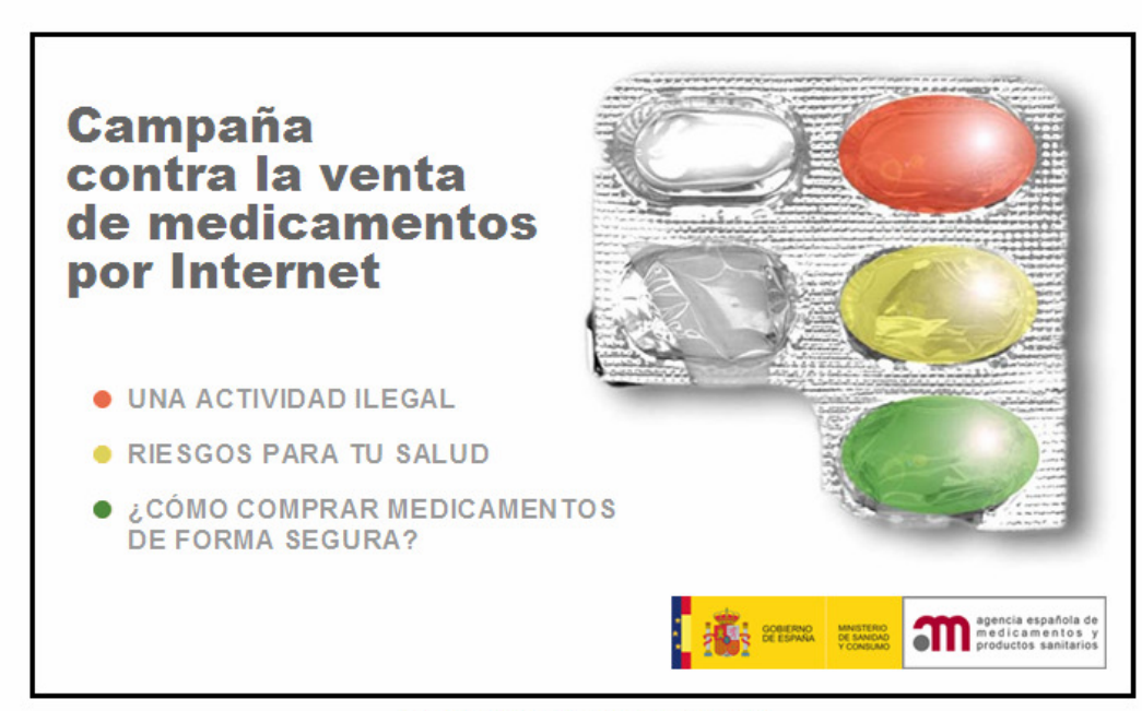
Fecha de publicación: 6 de febrero de 2009

Source: Spanish Agency of Medicines and Health Products, available online at: http://www.aemps.gob.es/informa/campannas/medicamentosinternet/ventaMed_Internet0 9/index.htm