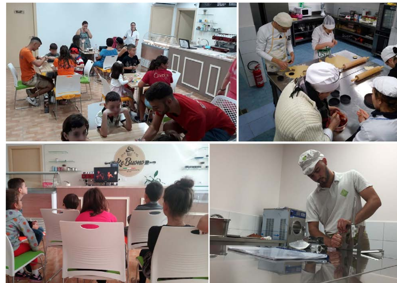
© Partners Albania for Change and Development

The project provided vocational training to young people, including former convicts and families of incarcerated individuals, and employed women and girls from vulnerable backgrounds, with approximately 75% of the staff composed of those affected by or at risk of crime. Over 700 children participated in activities organized with nine local schools, and four awareness campaigns were conducted on Roma culture, substance abuse prevention, disability inclusion, and gender-based violence. The pastry shop continues to operate under a five-year use agreement through the AAPSK and remains a space for social enterprise and community engagement. 14