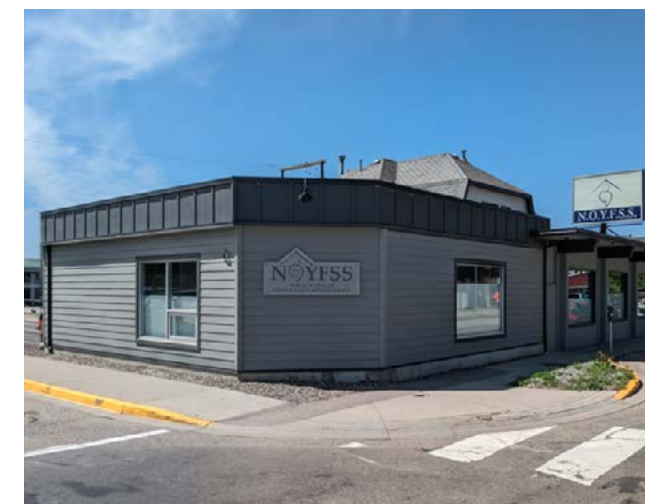
One of the beneficiaries was the North Okanagan Youth and Family Services Society.