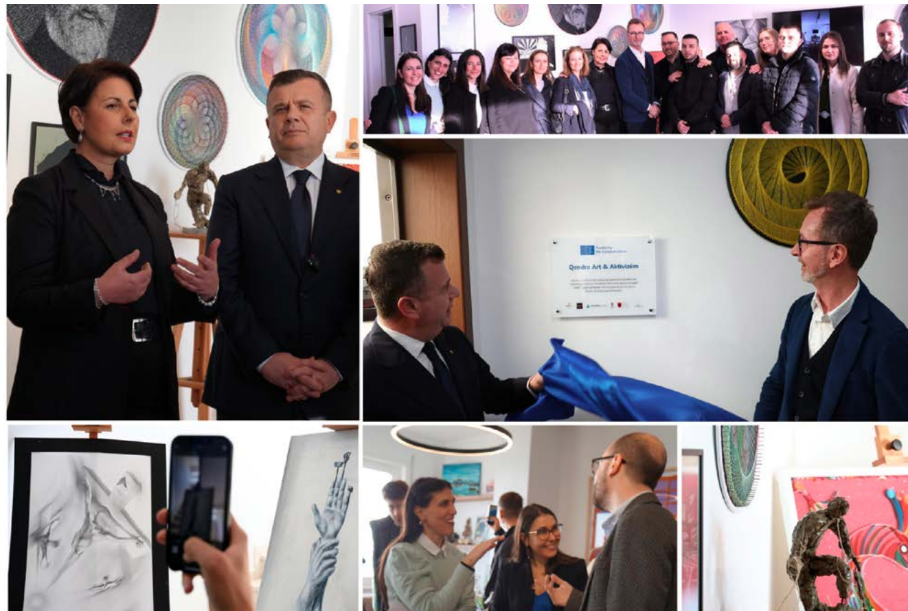
© Partners Albania for Change and Development

Albania's experience in the social re-use of recovered assets provides excellent examples that can be of use to policy makers and practitioners from other countries. Albania's approach revolves around three interlinked elements: a clear legal mandate, a dedicated institutional authority, and strong partnerships with civil society. The country's approach shows how confiscated properties can be turned into viable, locally driven initiatives with direct benefits for vulnerable groups. The involvement of civil society in managing and monitoring these assets has been essential to ensuring transparency and sustainability; when community organizations are consulted and involved, such programmes and projects generally prove to be more sustainable. Furthermore, the Albanian model has proven to be closely aligned with broader development goals, by linking asset recovery to employment generation, education, and social cohesion.