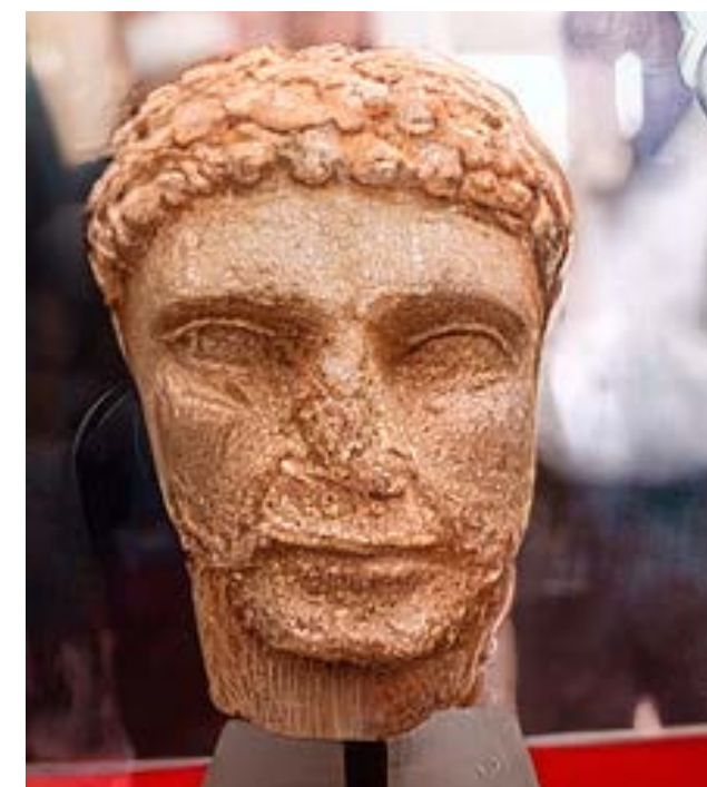
Ceremony for the Repatriation of Libyan Cultural Artifacts

A successful example of this is when the United States announced the return of Libyan cultural goods, valued at more than USD 500,000 in early 2022. The 'Bearded Man' and the 'Veiled Head of a Lady', which are dated between 300-400 B.C., were both looted from Cyrenaica in the 1980s and 1990s. Thanks to the investigation carried out by the Manhattan District Attorney's Office, its Antiquities Trafficking Unit and US Homeland Security Investigations, the pieces were successfully repatriated to Libya, with support from UNICRI. 118