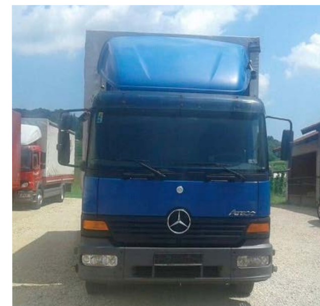
© Seized Property Management Agency of Federation of Bosnia and Herzegovina